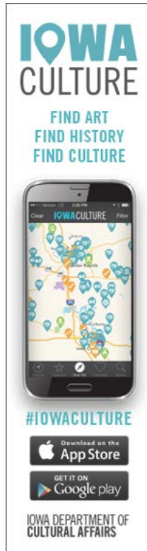
Download: Online Banner 160 px x 600px

Please use the following digital assets to promote the mobile app on your website. Please link to http://www.iowacultureapp.com . If you would like a graphic in a specific size please contact us at iowa.culture@iowa.gov .