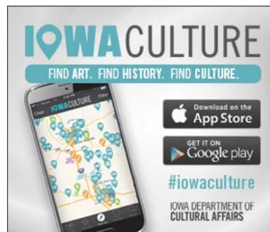
Download: Online Banner 300px x 250px